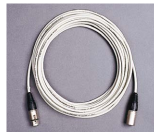
Extension cable XL, GA-00150