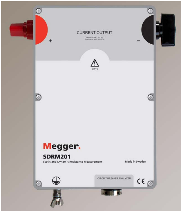
The SDRM201 is intended to use for both static and dynamic resistance measurements (SRM and DRM) on high voltage circuit breakers or other low resistive devices