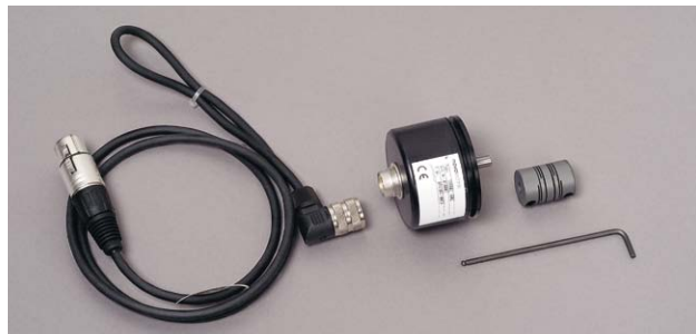
Rotary transducer, Novotechnic IP6501 (analog)