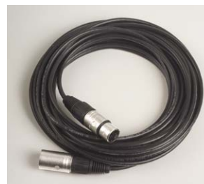
Extension cable XLR, GA-01005