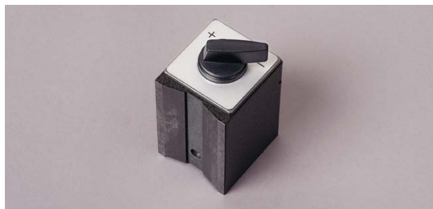
Switch magnetic base