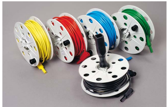
Cable reels, 20 m (65.5 ft), 4 mm stack-able safety plugs