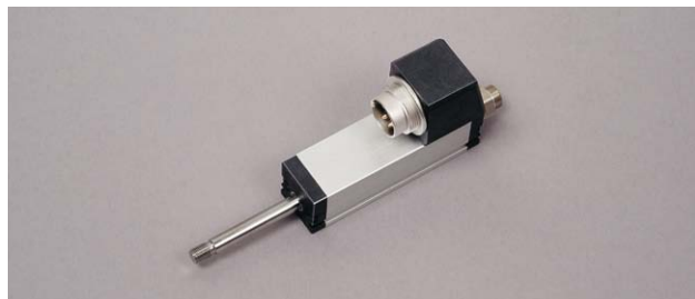
Linear transducer, TS 25