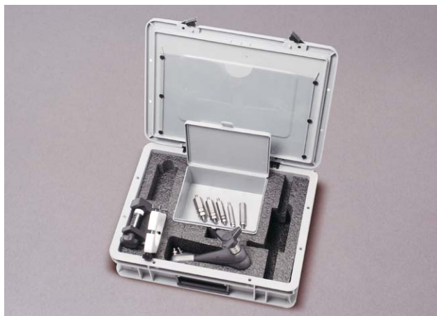
Rotary transducer mounting kit