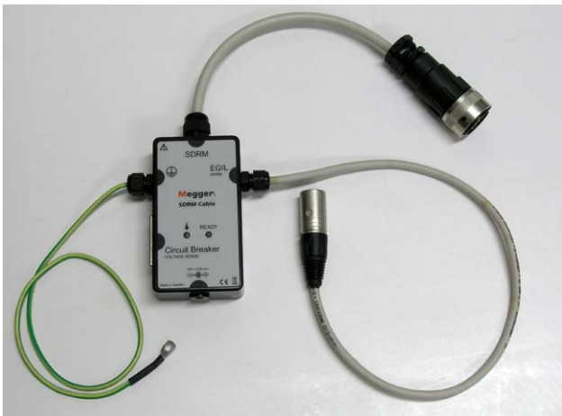
The SDRM Cable