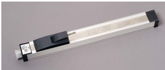
Linear transducer, TLH 225