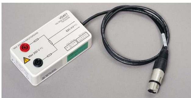
Voltage divider, VD401