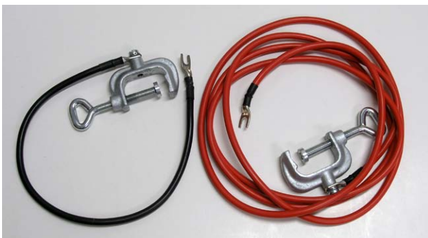
Current cables for SDRM201, the red cable is 3.0 m (9.8 ft) and the black one is 0.5 m (1.6 ft)