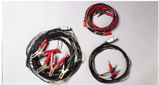
Multicable sets GA-00160 and GA-00170 and cable set GA-00082