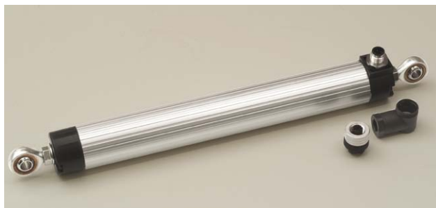
Linear transducer, LWG 150