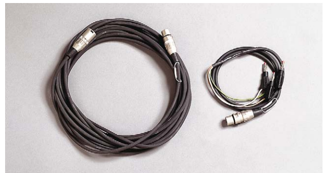
Transducer cables GA-00041 and GA-00042